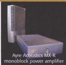
Ayre Acoustics MX-R monoblock power amplifier

T his year's "Product of the Year" category found an extraordinary nine products winning first-place votes, spanning nearly the entire spectrum of prices and component categories, from the JL Audio Fathom f113 powered subwoofer ($3400) to the Krell Evolution 600 monoblock power amplifier ($30,000/pair). One very special piece of kit, the Shindo Masseto preamplifier, actually received three- and-a-half votes. I'm not sure if that's even possible, but there you have it. It all goes to show that what