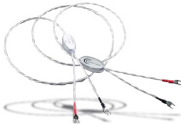
Crystal Cable Ultra speaker cables