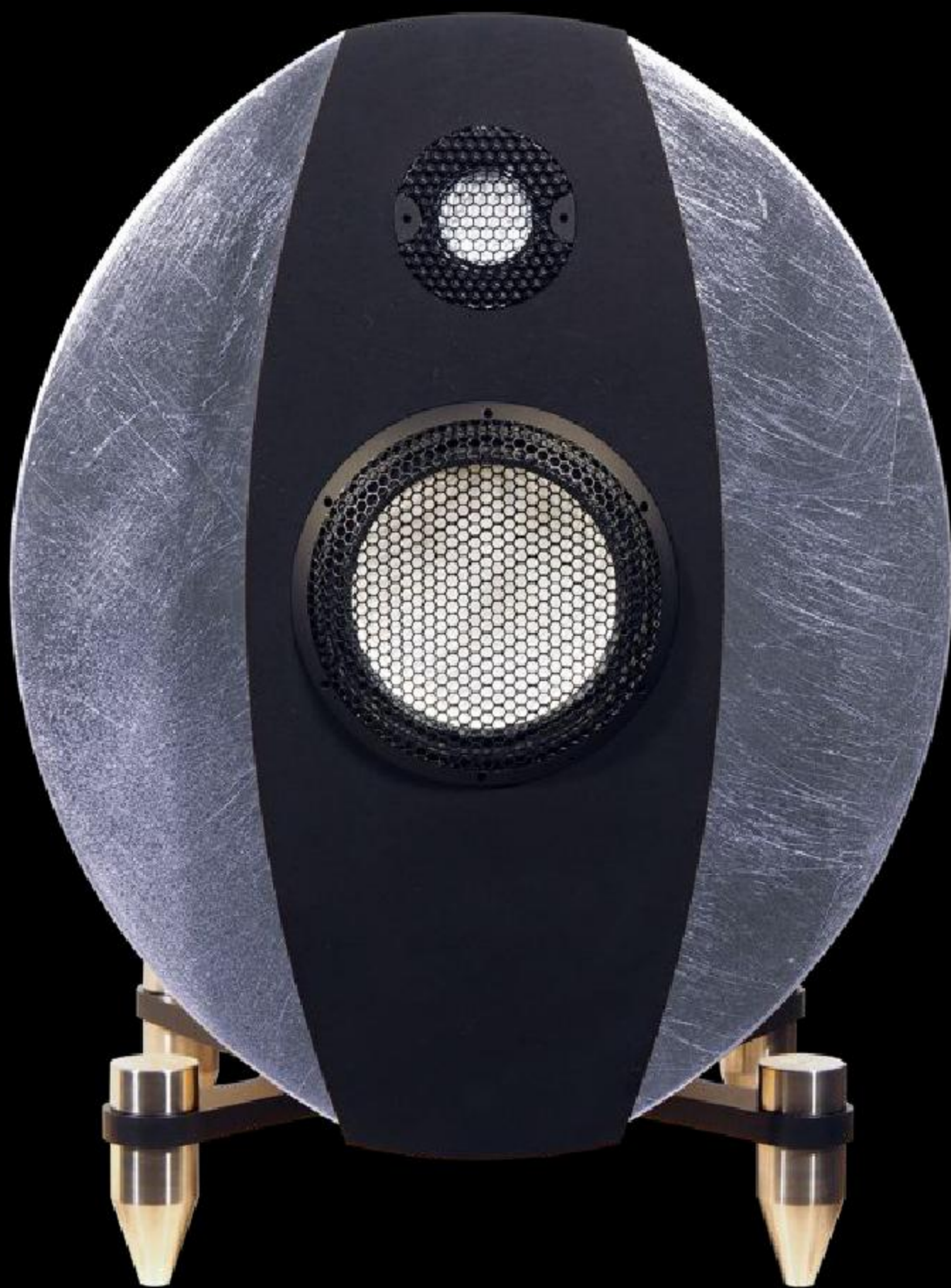
Silver Opuence (silver like leaf)