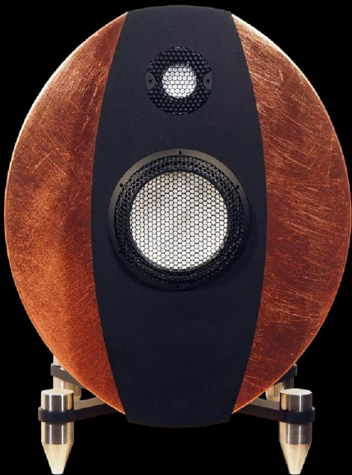
Shocking Copper (real copper leaf)