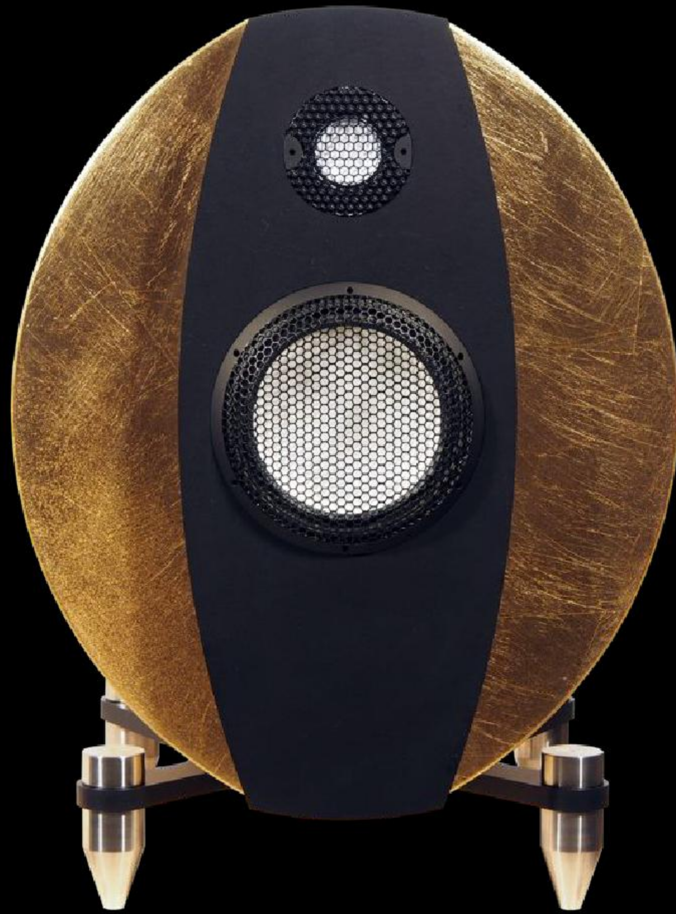
Golden Age (gold like leaf)